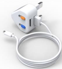
Fast Charging Enclosures