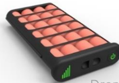
Drone Battery & Electrical Enclosures