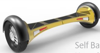
Self Balance Scooters / Hoverboards