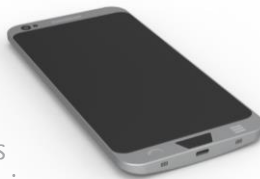
Mobile Phones & Portable Devices